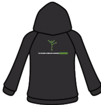
CareAlive Hoodies – Front & Back