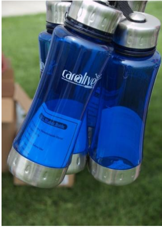
Care-Alive Water Bottles