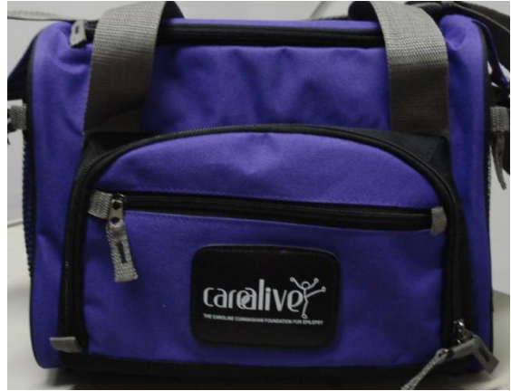
Care-Alive 12 Can Drink Coolers